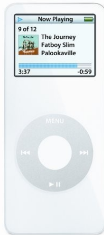
Apple 2 GB iPod Nano White or Black

This is an absolutely amazing bit of kit especially the new video feature which is extraordinary. The only problem is the scratches that you get on the screen, very easily. All in all it is a great piece of kit to take with you anywhere!