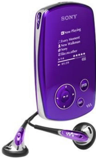
Sony NWA1000V 6 GB HDD Walkman

So if you want an mp3 player with a quality name but don't want to spend £100's on one buy the shuffle at £50 lay back and see where the music takes you.