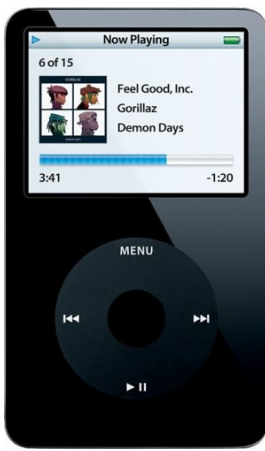
Apple iPod - 30GB – Black or White [with video playback]

Here is a list of some of the best MP3 players available.